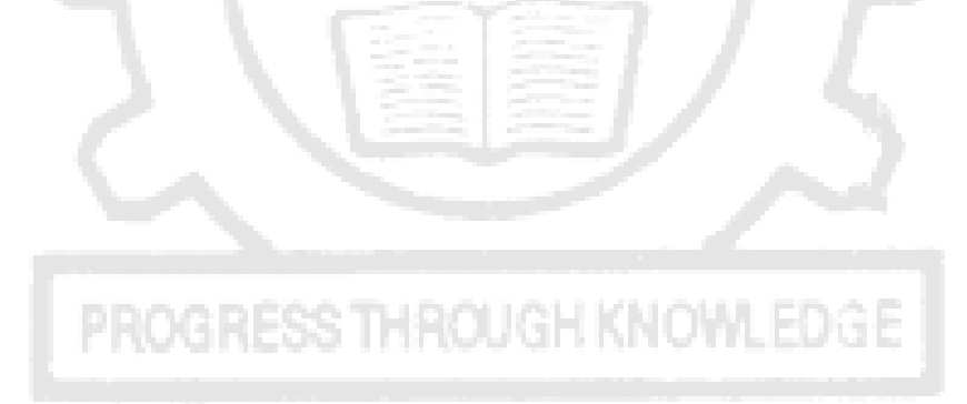
Centre for Academic Courses Anna University, Chennai-600 025

1, 2 and 3 are correlation levels with weightings as Slight (Low), Moderate (Medium) and Substantial (High) respectively