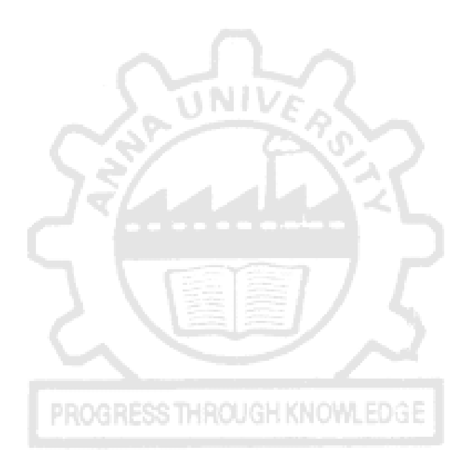
DIRECTOR Centre for Academic Courses Anna University, Chennai-600 025