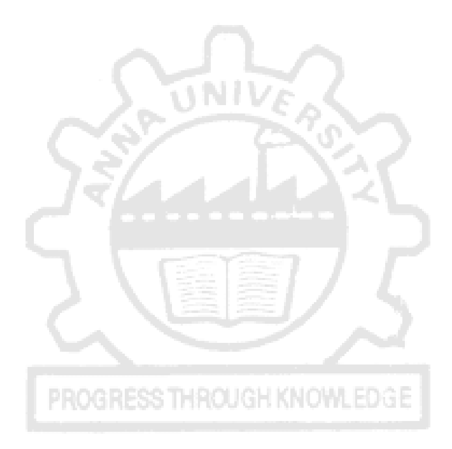
DIRECTOR Centre for Academic Courses Anna University, Chennai-600 025